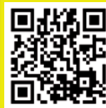
Photo - 14344 - Crédit photos: J.-F. Vuarnet (Châtel Tourisme) - JM. Gouillard - S. Cochard - V. Thibaut - J. Jacquier - Les Laurentides - Foblia - X Document non contractuel - ne pas jeter sur la voie publique. Les prix indiqués s'entendent toutes taxes comprises en euros et au taux de TVA en vigueur à la date de l'achat. Les renseignements et prix indiqués dans ce document sont donnés à titre indicatif, et sont susceptibles de pouvoir être modifiés. Châtel Tourisme ne peut être tenu responsable d'un changement quel qu'il soit.

Tél. 33 (0)4 50 73 25 58 Portable 33 (0)6 86 93 56 54 Fax. 33 (0)4 50 73 22 87 communication@chatel.com