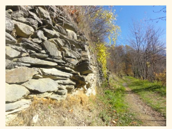
The stone walls start falling apart

We have noticed that some of the stone walls along the trail start falling apart here and there (see the picture on the right). You may also encounter vipers on the rocky slopes. Watch out!