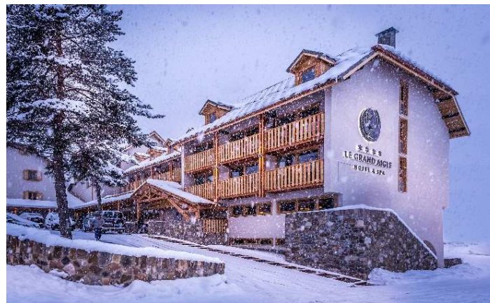
Le Grand Aigle Hôtel & Spa ****

Discover the hotel here >>> www.hotelmarmotel.com