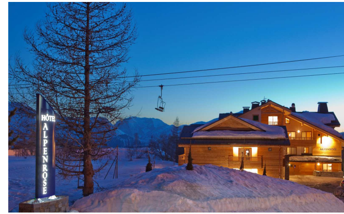
Alpenrose Suites Hôtel****

Discover the hotel here >>> www.hotel-picblanc-alpes.com