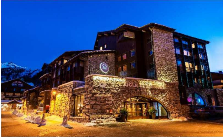
L'Aigle des Neiges Hôtel & Spa ****