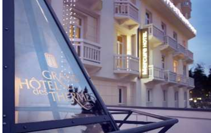
Mercure Grand Hôtel Des Thermes ****

Discover the hotel here >>> www.hotelaigledesneiges.com