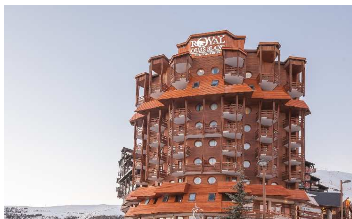
Royal Ours Blanc Hôtel & Spa ****

Discover the hotel here >>> www.hotel-saintcharles.com