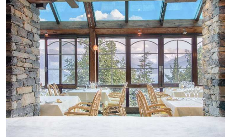
Hôtel Restaurant Le Mont-Paisible ***

Discover the hotel here >>> www.gdhotel-brides.com