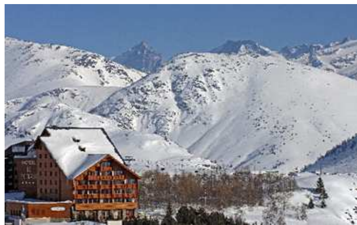
Hôtel Le Pic Blanc ****

Discover the hotel here >>> www.hotelmarmotel.com