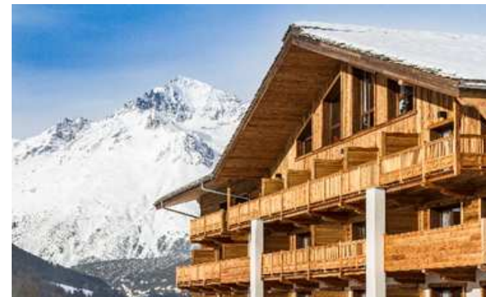
Saint-Charles Hôtel & Spa ****

Discover the hotel here >>> www.hotelgrandaigle.com