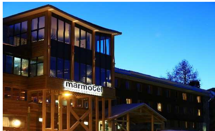
Marmotel & Spa ***